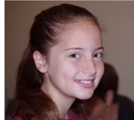
Our Youngest Member